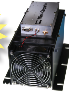
ZHL-30W-262-S+ Price: $1995.00 (QTY 1-9)